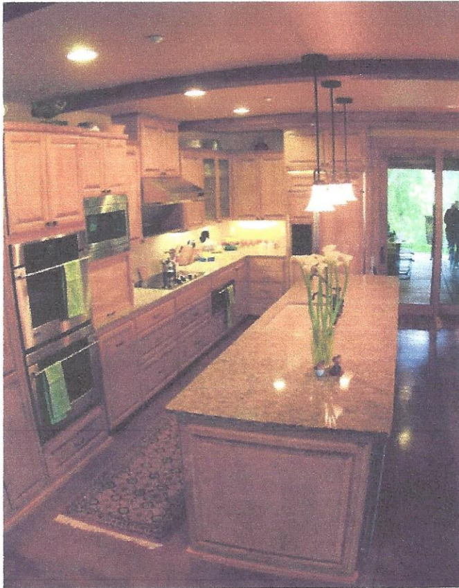
The kitchen features an appliance garage that hides small appliances.

The kitchen is modern, but with a very personal feel. Both the refrigerator and the dishwasher have removable wood paneling that matches the red maple windows and cabinets. There is a small wine fridge in the center island and built-in inconspicuously with the cabinets on the back wall, is a warming drawer and what some might call an "appliance garage" that has a sliding door that hides small appliances, such as blenders.