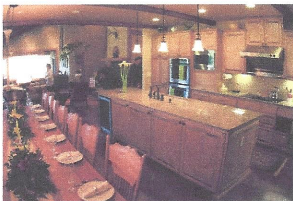
The kitchen is modern, but with a personal feel.